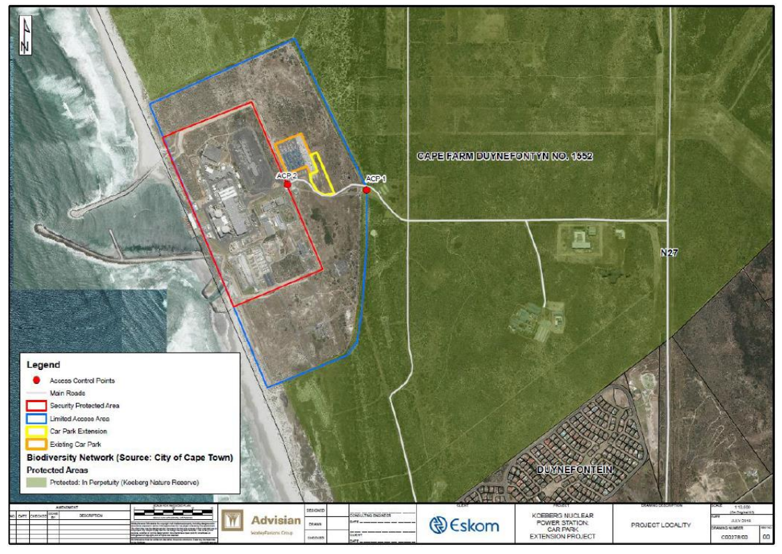
Figure 2: Site locality within Koeberg Nuclear Power Station.