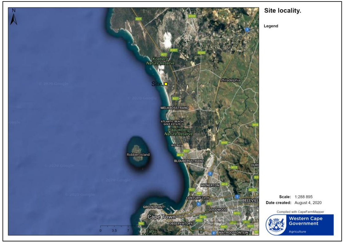
Figure 1: Locality of Koeberg Nuclear Power Station (site).

• Cape Farm Duynefontein No 1552, portion 0